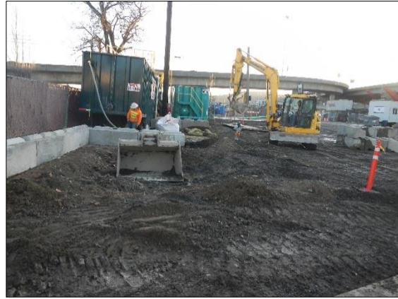
Sediment and erosion control best management practices (BMPs), shown on the right, will be used throughout construction to control dust and keep dirt contained on site.