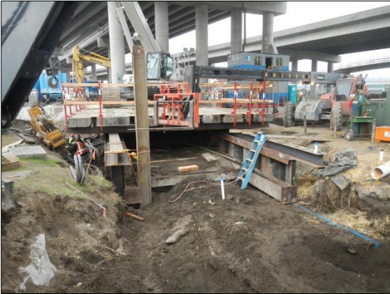
The trestle (shown above) will continue to be installed, eventually moving into the Duwamish River. It will be used to hold the crane and excavator needed for pipe installation.