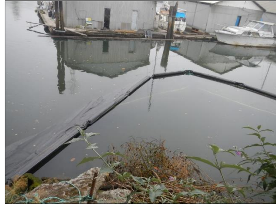
To protect the Duwamish River during construction, crews installed a flexible sediment control barrier, also known as a turbidity curtain, to prevent silt and sediment from entering the waterway..