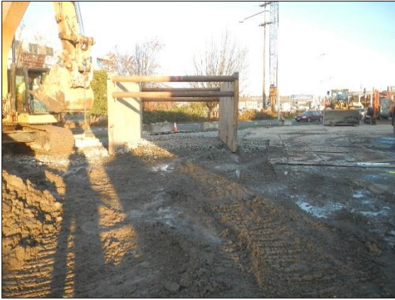
Crews will use shoring boxes during conveyance construction to secure excavation.