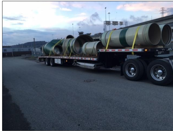
60-inch diameter pipe is being delivered and stored on the construction site prior to installation..

Visit the project website: www.kingcounty.gov/GeorgetownWWTS