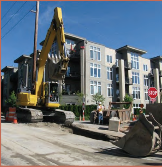
Construction on King County sewer project in Auburn begins next year!