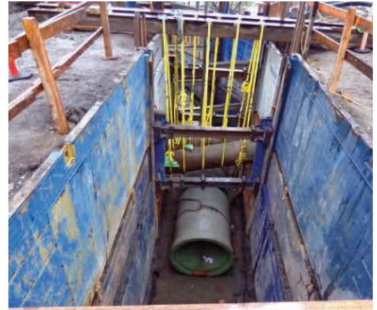
Excavations to install the pipe range in depth from 15 – 30 feet. Do not approach open excavations for your safety and the safety of our crews.

Please join us on Thursday, November 17, for a neighborhood walk on 78th Ave SE