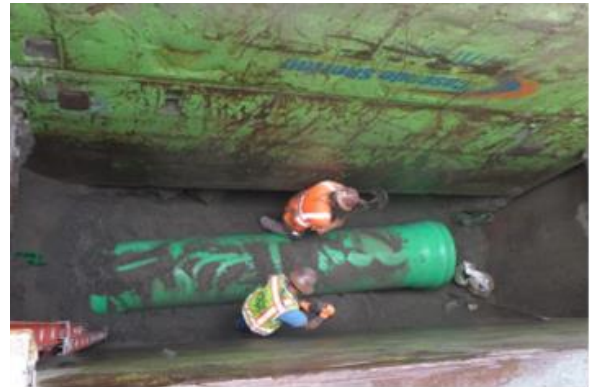
Crews install pipe deep underground via "open cut" construction.