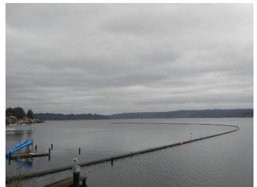
Crews will additionally affix lights to the floating pipe to help locate the pipe between the two workboats.

Neighbors living on Lake Washington will see increased lights on the lake while the pipe is floating. Each workboat will have spotlights to illuminate the pipe and work areas to ensure safety. Boat captains will minimize pointing these spotlights toward shore. Neighbors may also notice increased noise at night coming from Enatai Beach Park once the pipe pull starts.