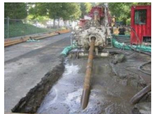
Cranes on barges will attach the assembled pipe to a cable. Then crews will lift, align, and steer the pipe into the drill hole as shown

As the pipe gets pulled from Enatai Beach Park to Sweyolocken, neighbors living near the Sweyolocken Pump Station may notice increased noise at night.