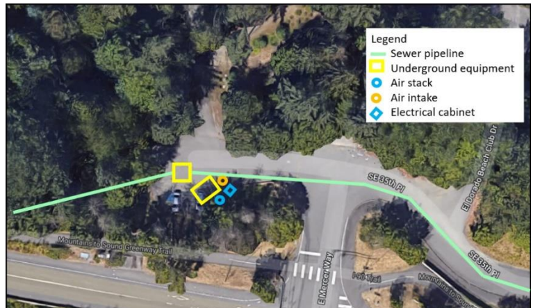
Approximate locations of the above and below-ground structures that will support future operations.

Parking will be restricted in the cul-de-sac on SE 35th PL while crews work in this area. We will partially close SE 35th PL between E Mercer Way and Frontage Road. Residents will still be able to access their homes. We will also build temporary access roads for construction machinery. The roads will connect to our western work area on 97th Avenue SE and our eastern staging area at the Mercer Island Boat Launch.