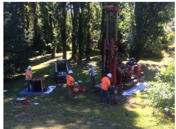
Typical drill rig for soil sampling.