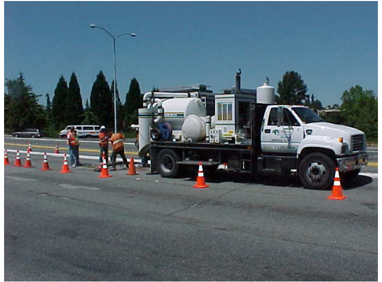
Vacuum truck at work

See map on reverse for exact locations of potholes.