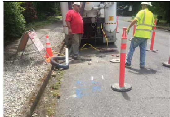
Typical vacuum truck used for potholing

Most of this work is expected to be completed by March. We will keep you updated on any schedule changes as needed.