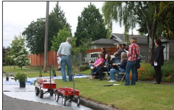
King County staff hold neighborhood “walk and talks” to help residents understand how projects will affect their street.

Between 10:00 and 11:00 a.m., project staff will walk around the pump station site and up to the corner of SE 22 nd Way and 78 th Ave SE with project neighbors to share the latest designs, gather feedback and answer questions.