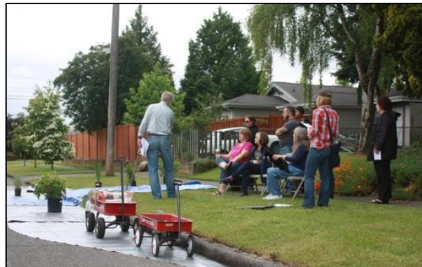
King County staff hold neighborhood “walk and talks” to help residents understand how projects will affect their street.