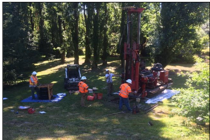
Typical drill rig used for soil sampling work.

Please watch for equipment and signs in the area, travel slowly to stay safe, and follow direction from crews.