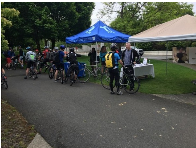
King County's project team spoke with bicycle commuters at Bike Everywhere Day 2017.