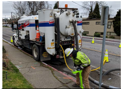
Typical equipment used for potholing.