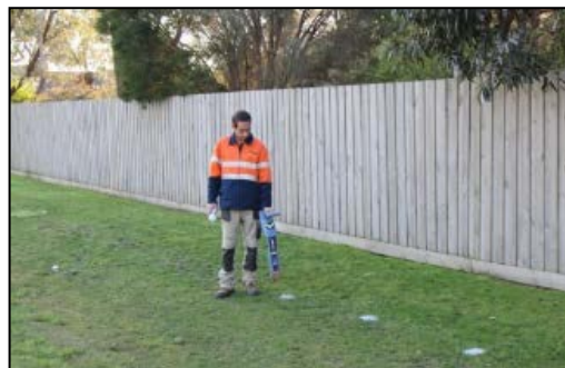
Example of equipment used for locating underground utilities.