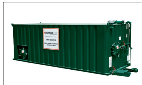
Large steel tank used for storing potholing material.