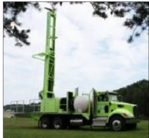
Drilling rig used for boring holes.