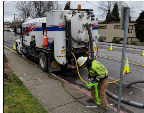
Vacuum truck used for potholing.

King County Wastewater Treatment Division is continuing field investigations to inform design of a sewer upgrade project in Mercer Island and Bellevue. Beginning as early as January 9, crews will conduct boring, potholing, and survey work to identify existing utilities near the project route. Crews will work near Sweylocken Pump Station to confirm the location of existing utilities. Work will be done in two stages, see schedule below. All work will be complete by February 1. See map on back for approximate work location.