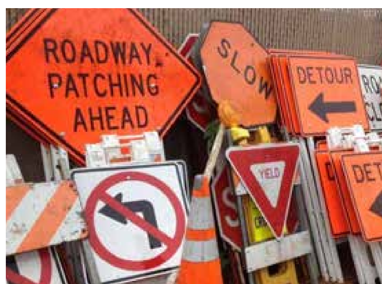
Signage will be provided directing all users to the selected detour. Flaggers will direct traffic as needed.