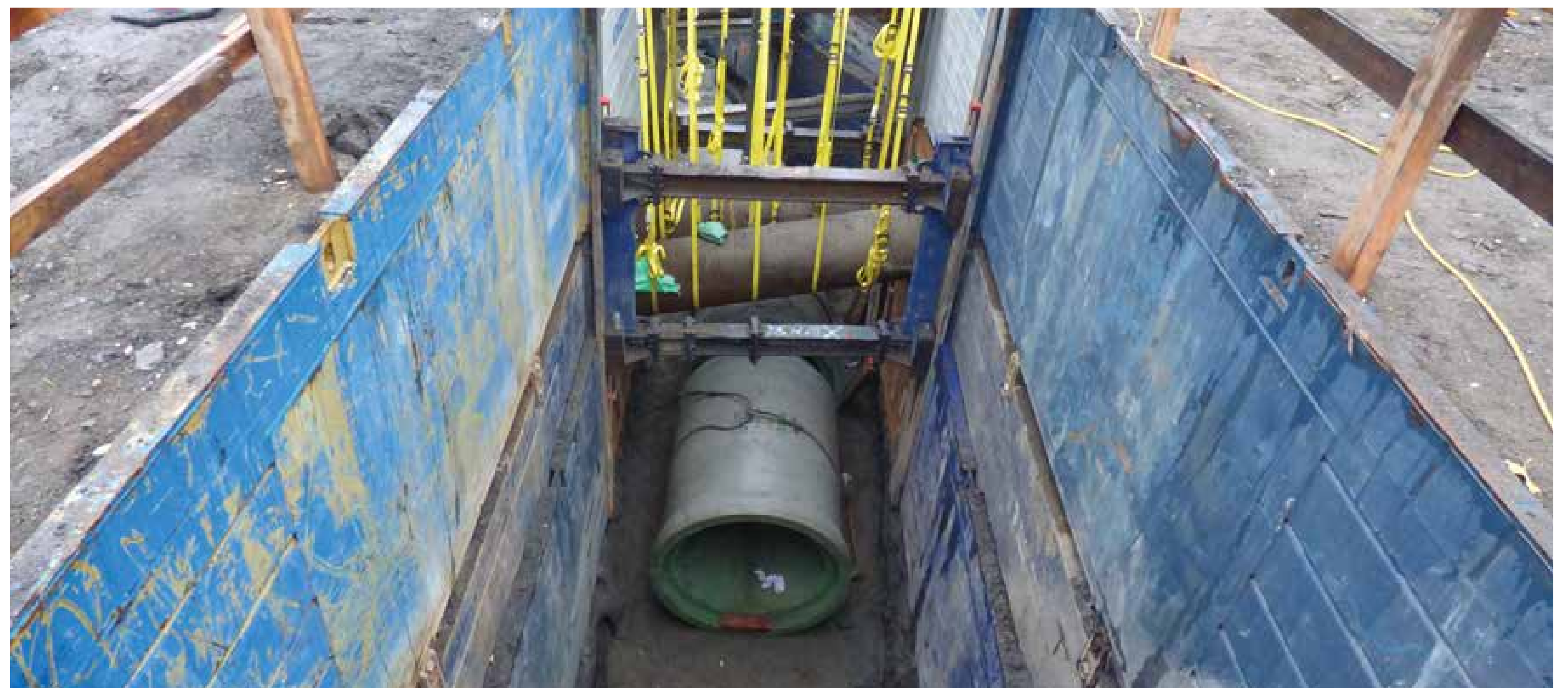
Example of open cut construction.

Crews will use open-cut trenching to lay pipe along the trail. In open-cut construction, crews dig from the surface to the pipe depth, lay the pipe, then cover the pipe and restore the surface. The work zone along the trail will be at least 26-feet wide to safely accommodate materials, equipment and construction workers. In some areas it may be wider.