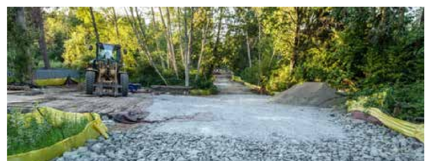
Example site during construction