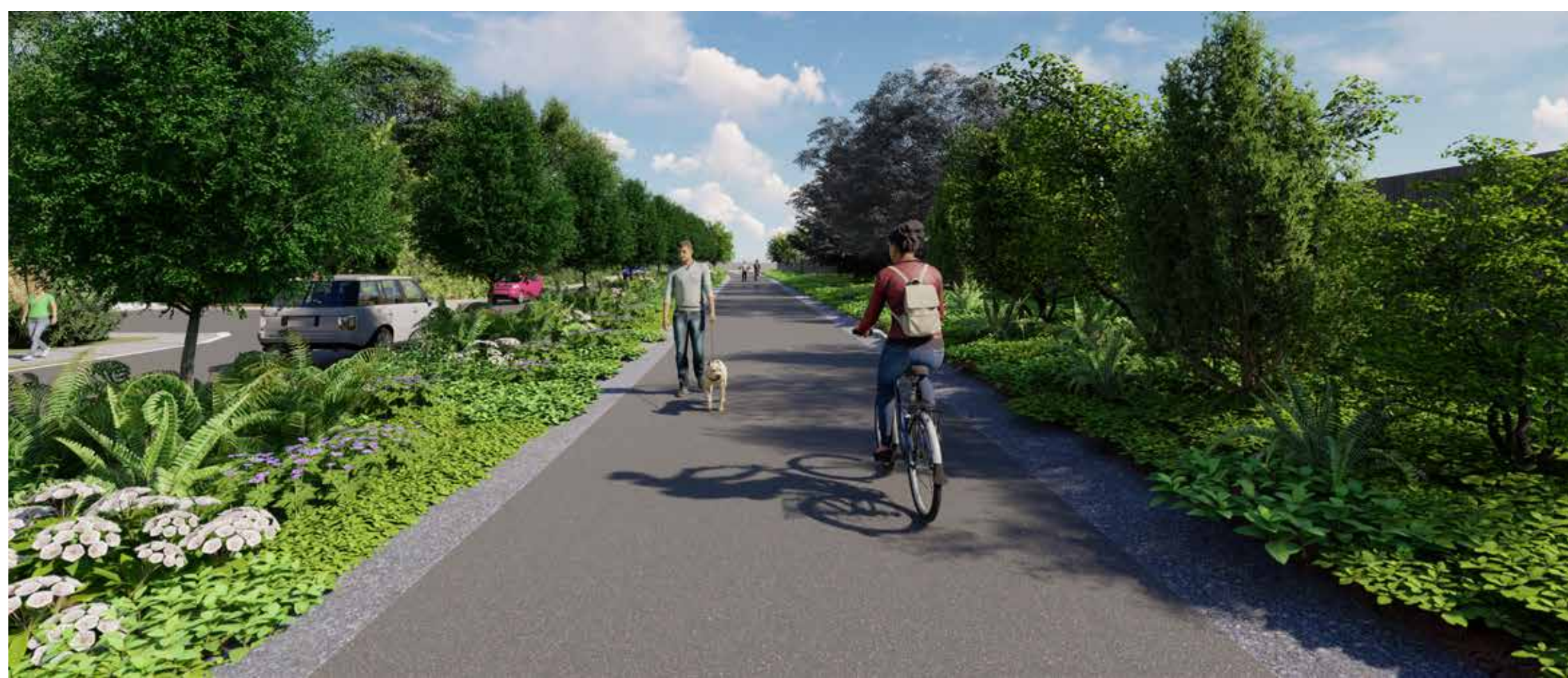
Future trail near Covenant Shores Retirement Community.