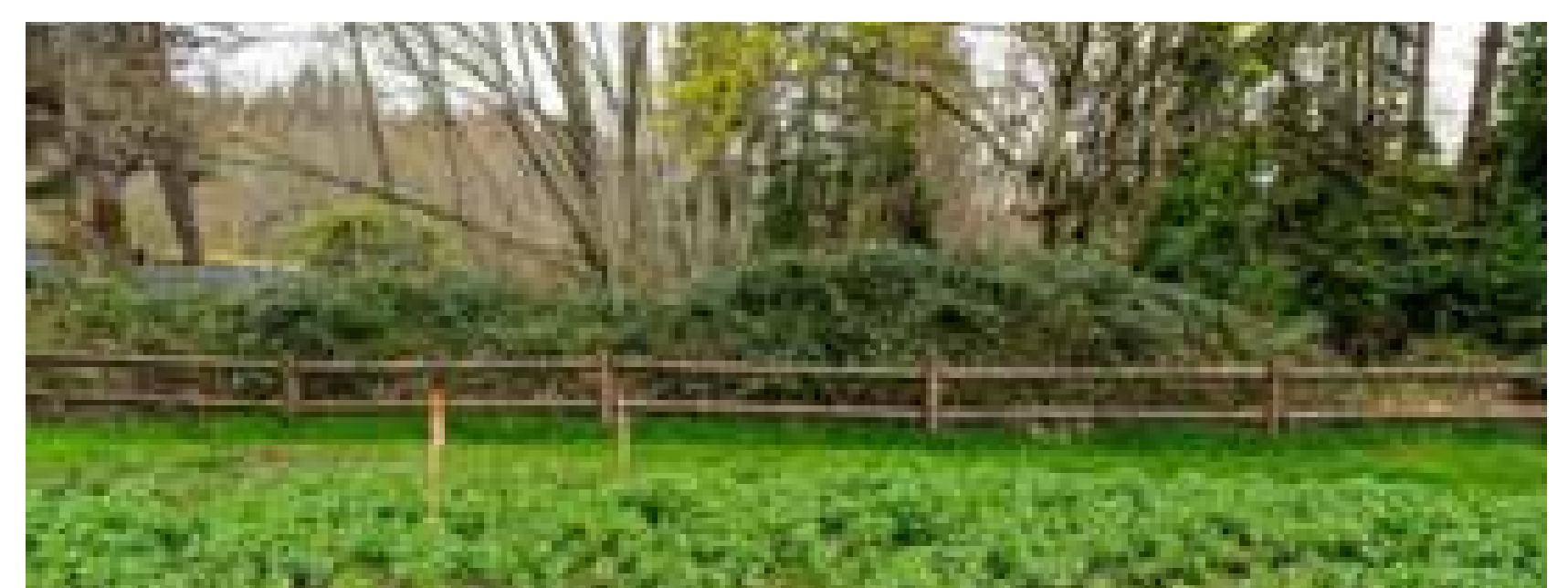
Example site before construction