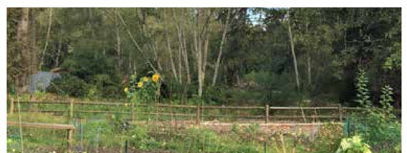
Example site after construction