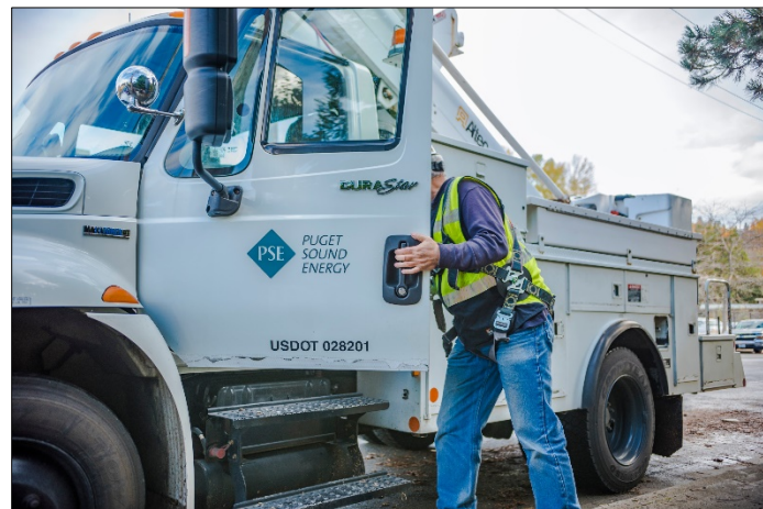
PSE crews at work