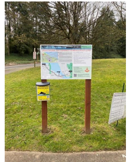
Project sign and flyer box at Mercer Island Boat Launch.