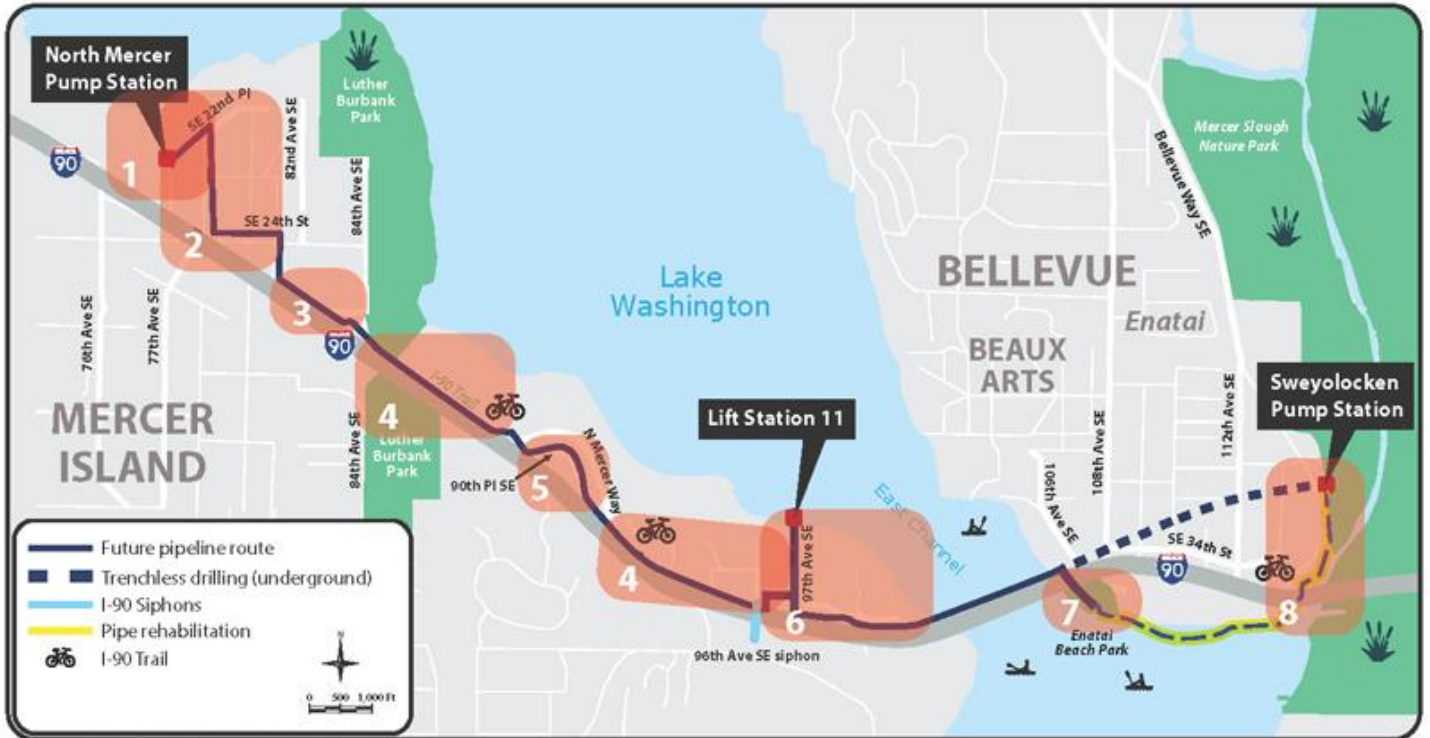
Utility location will take place along the future pipeline route in Mercer Island and Bellevue