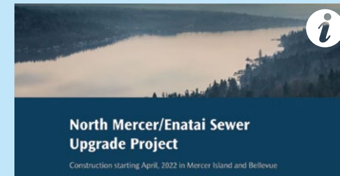
Find us online at kingcounty.gov/MercerEnataiSewer