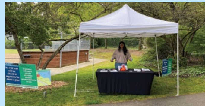
Staff hosting booth at Bike Everywhere Day.