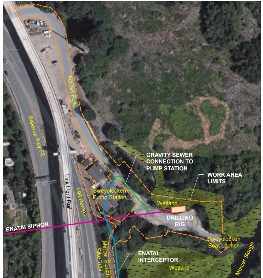
Sweyolocken Boat Launch and Pump Station Site During Construction of the Enatai Siphon Connection

Will the work affect wetlands and trees? Yes. About 20 trees will be removed, largely to make room for a staging area to store equipment and materials. The work area will extend into a wetland at one point. We will completely restore the affected wetland to its pre-construction condition once the work is finished.