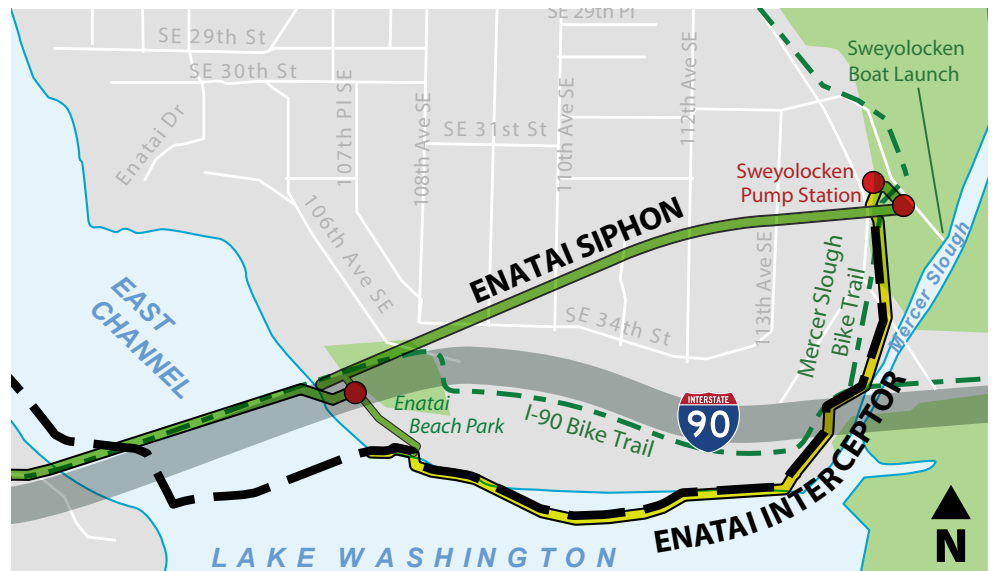
Installing the Enatai Siphon and upgrading the Enatai Interceptor will both have impacts in the area around the Mercer Slough and Swayolocken Boat Launch

The first part—installation of the Enatai Siphon by a construction process called horizontal directional drilling—will take place at the site of King County's Swayolocken Pump Station, along the access road to the boat launch. The Enatai Siphon will provide additional capacity for conveying wastewater for the North Mercer/Enatai system. Future wastewater flows that exceed the capacity of the existing Enatai Interceptor in Lake Washington will be diverted to this new siphon, which will be installed by drilling under the Enatai neighborhood. The siphon is essential to the project mission of ensuring that the system has enough capacity for wastewater flows expected through 2060.