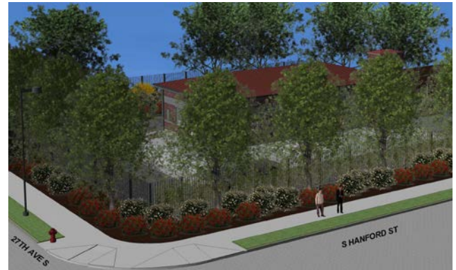
New sidewalks and lighting create safe pedestrian corridors to the Mt. Baker Light Rail Station.