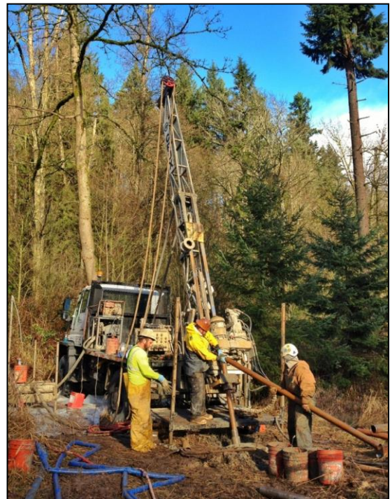
Crews conduct geotechnical investigations as part of the early analysis.

In 2012, WTD started geotechnical evaluations to identify the feasibility of a tunnel. The geology and hydrology were different than predicted (less, poorly indurated rock and a high water table) and it was determined that a tunnel would require too many costly interventions to make the project feasible. It is estimated that the project would cost $110 million more than the pump stations upgrade.