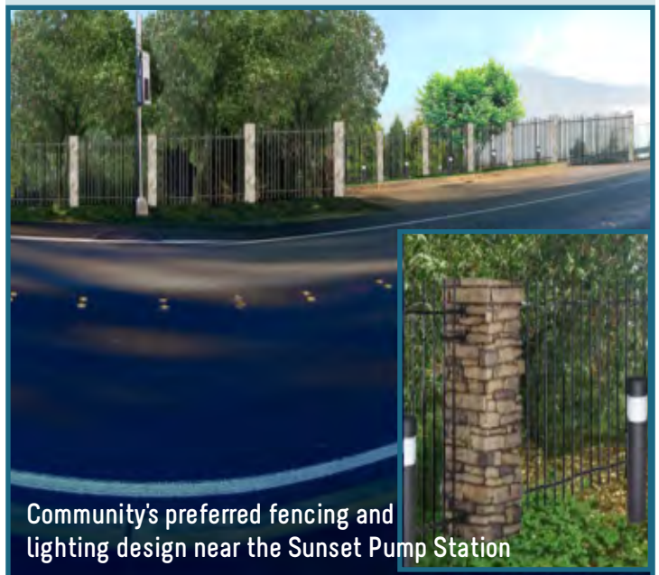
Community's preferred fencing and lighting design near the Sunset Pump Station

Thank you for sharing your preference and input!