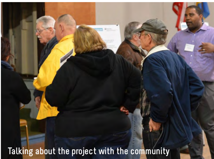
Talking about the project with the community