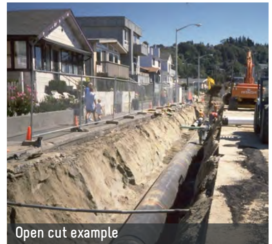
Open cut example