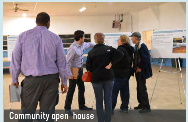
Community open house