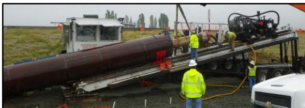
Crews will install steel conductor casings as the first step in HDD

*The schedule and duration for HDD work is tentative and is subject to change as work progresses. We will continue to provide email notices and door fliers with updates on timing of specific construction activities.