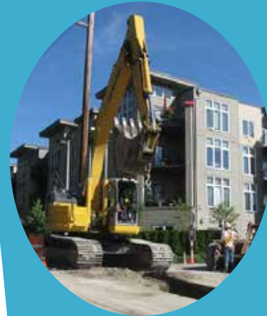
Pipeline construction will include “open cut” or “cut and cover” work.

Visit the project website for information: kingcounty.gov/NCI