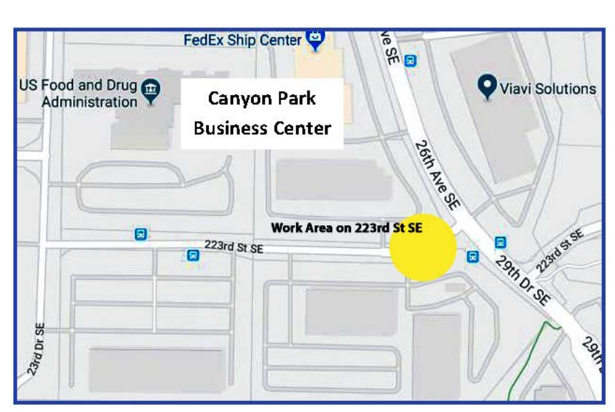
Paving work area along 223rd Street SE in Canyon Park