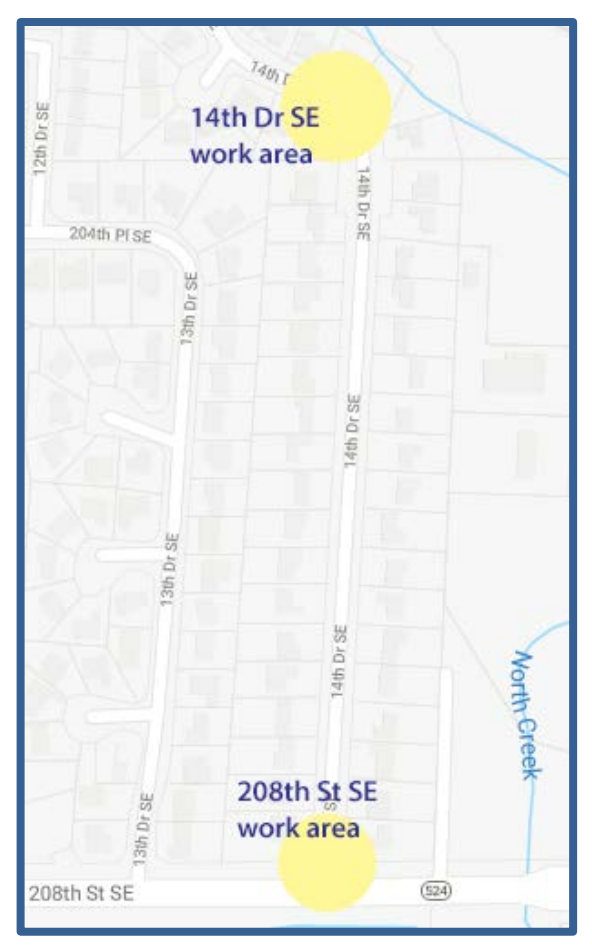
Paving work areas along 14th Drive SE