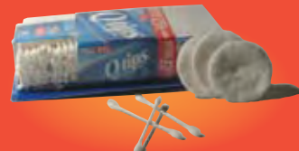
Cotton balls, swabs & pads