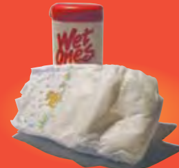
Disposable diapers, nursing pads & baby wipes