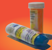
Expired & unused prescription or over-the-counter medications.