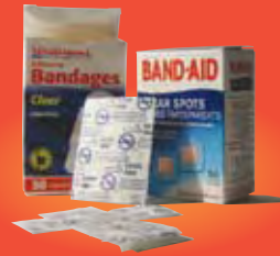
Band-aids & bandage wrappers