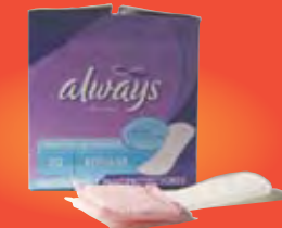
Mini & maxi-pads