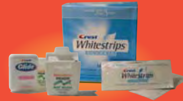
Dental floss & teeth whitening strips