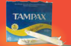
Tampons & applicators