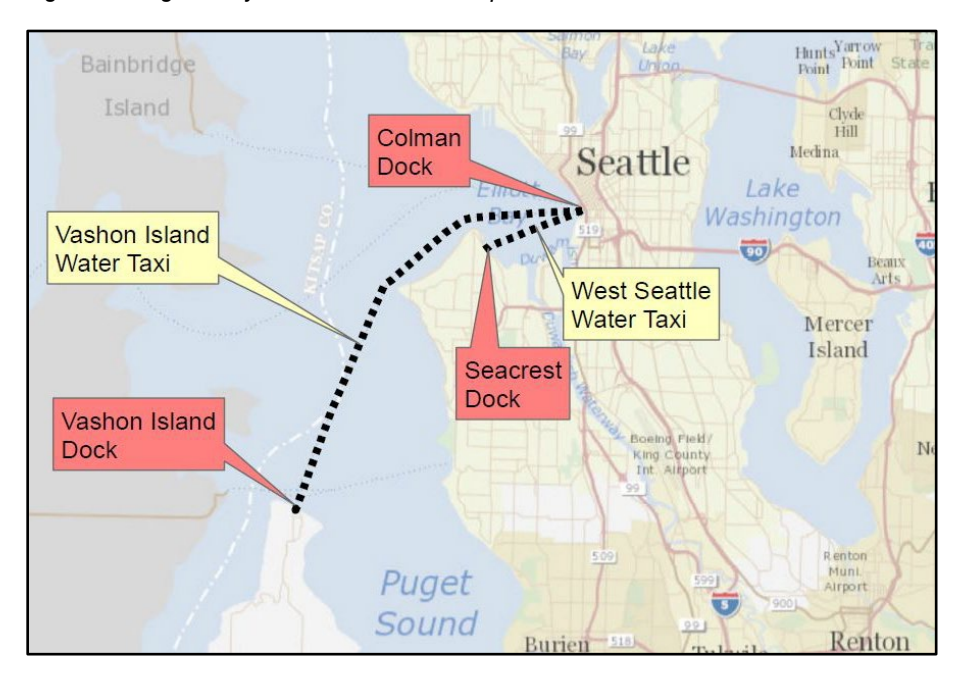
Figure 3: King County Water Taxi Route Map

In 2019, King County's Water Taxi provided service for over 700,000 passengers (prepandemic) system-wide. Water taxi ridership declined with the pandemic, as did ridership on other Metro services, but is recovering. As of September 2022, there were more than 334,000 boardings in 2022.