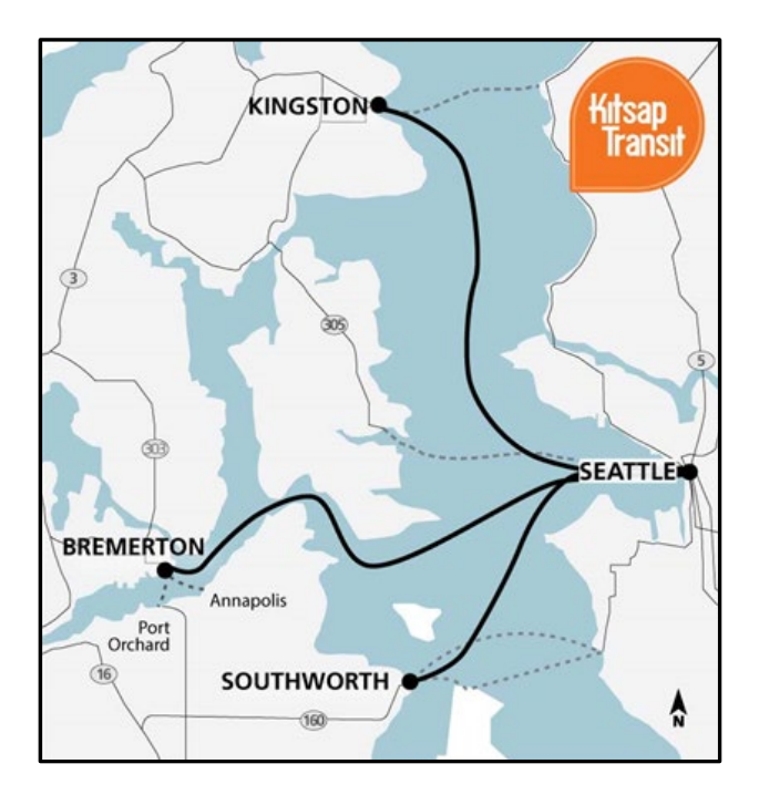
Figure 4: Kitsap-King County Ferry Routes. Kitsap Transit Fast Ferry Routes shown in solid black. Washington State Ferry routes to Seattle and Kitsap Transit foot ferry routes from Bremerton to Port Orchard and Annapolis shown in dashed gray.<sup>2</sup>

Kitsap Transit owns its Bremerton passenger-only ferry dock and leases its Kingston dock from the Port of Kingston. Vessels for those routes are moored at these docks when not in service. For the Southworth route, Kitsap Transit moors its primary vessel at its Bremerton dock and shares use of the Southworth dock with Washington State Ferries. Kitsap Transit and Washington State Ferries are jointly pursuing development of a second landing site at Southworth.