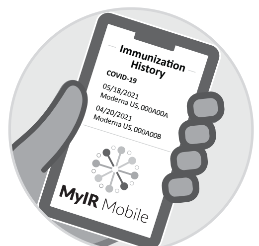
Digital record from MyIRMobile.com or other app