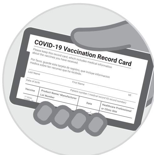
Photo of vaccination card