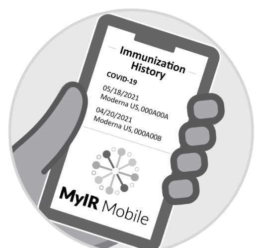
Record jen MyIRMobile.com ak bar juon app