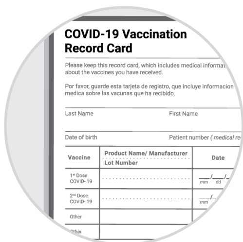
Wa card eo

King County ej aikuj kein kamol in COVID-19 wa ak teej negative ilo jikin in. Form ko rej eman nan kamol ej: