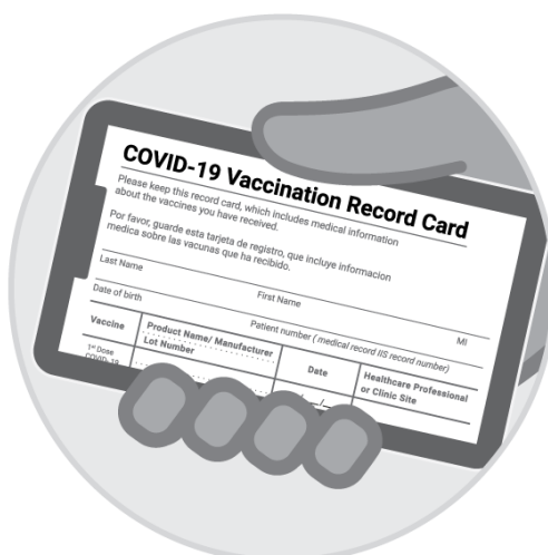
Pija in Rekoot Kaat in Wā in Bōbrae ko.