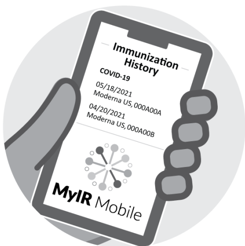
Diiwaanka MyIRMobile.com ama barnaamij app oo kale