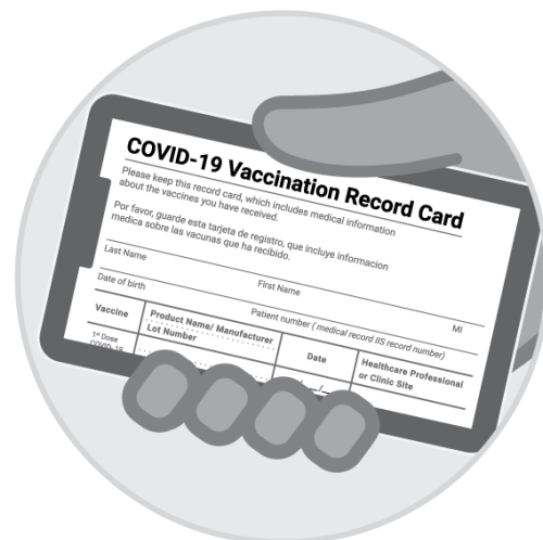
Sawir Kaadh Tallaal card