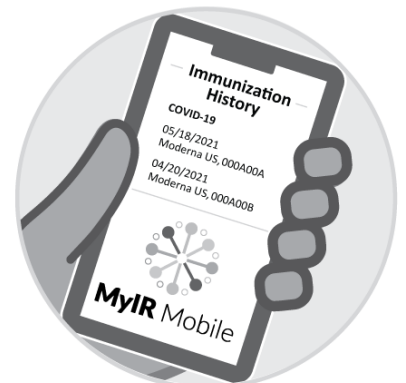
Rekodi kutoka MyIRMobile.com au programu nyingine