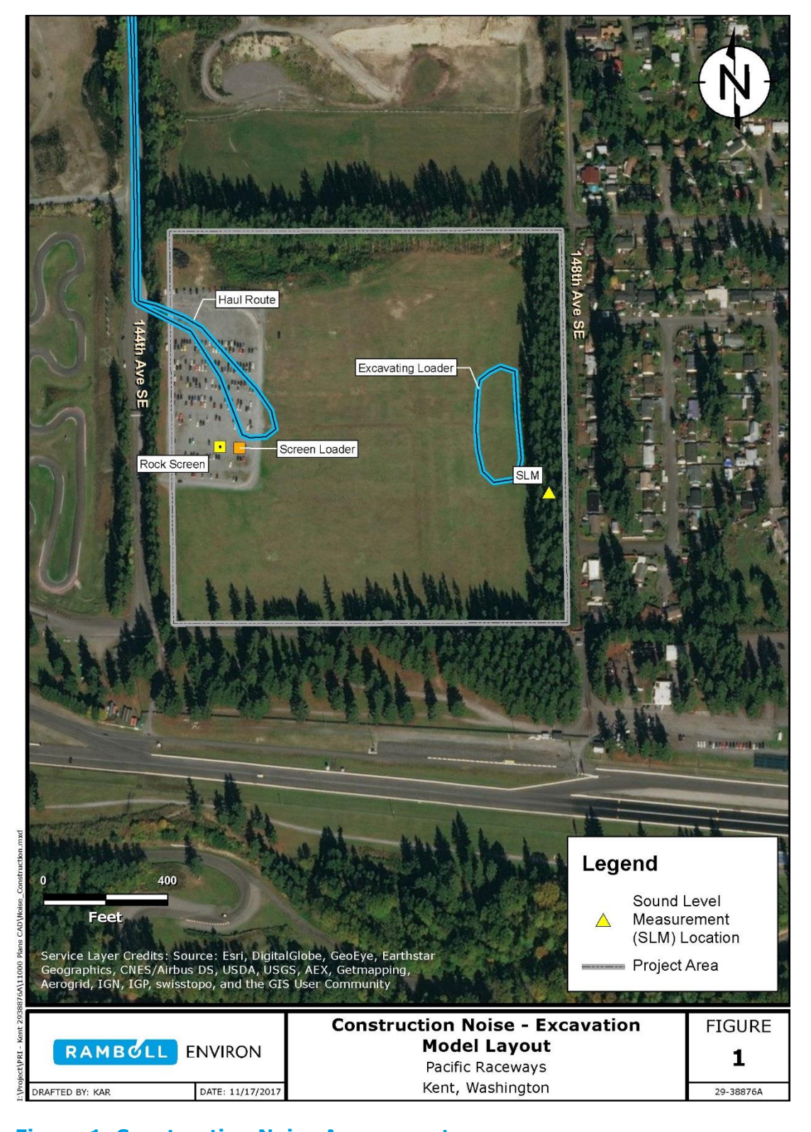
Figure 1. Construction Noise Assessment