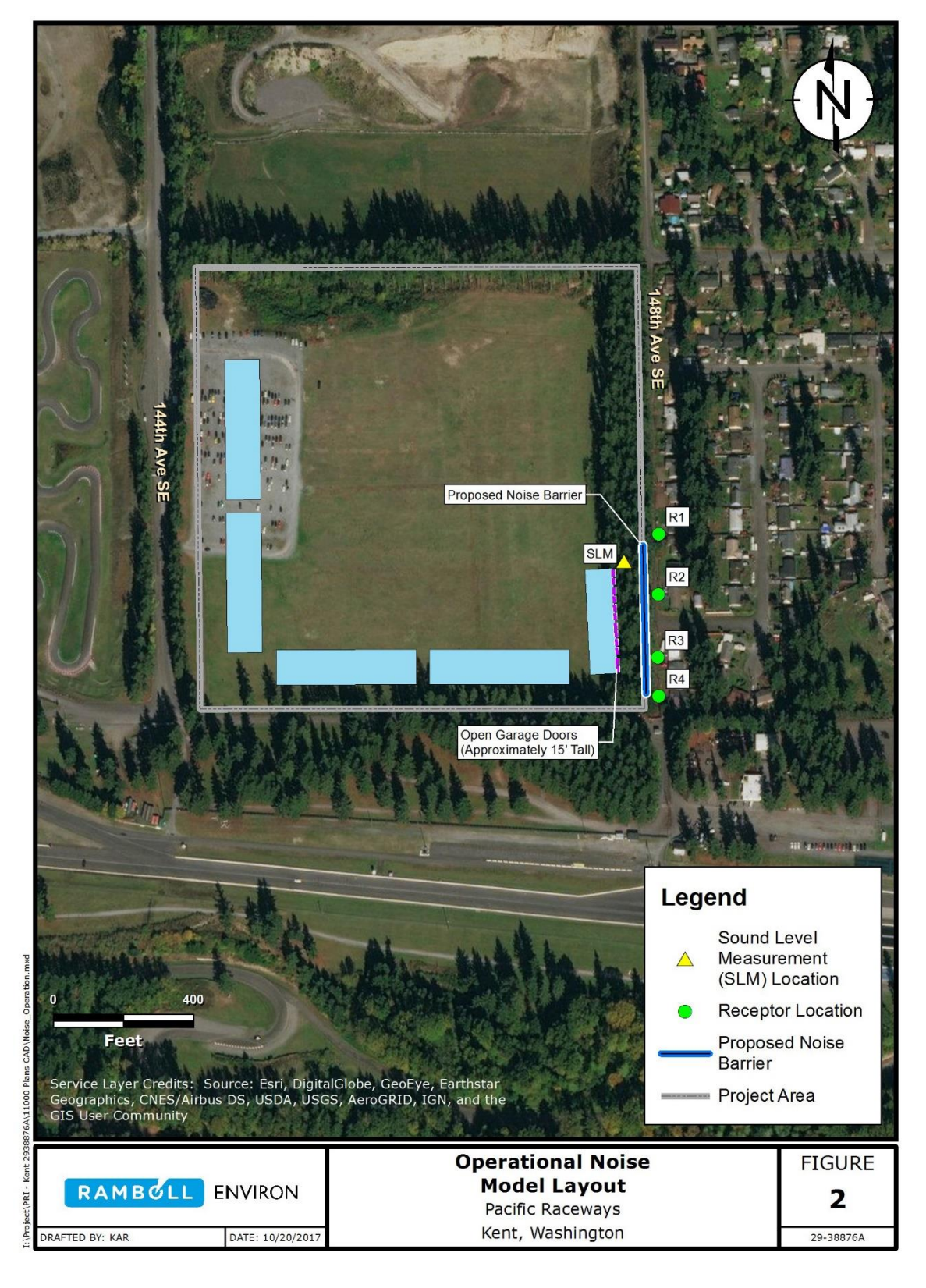
Figure 2. Operational Noise Assessment, Barrier