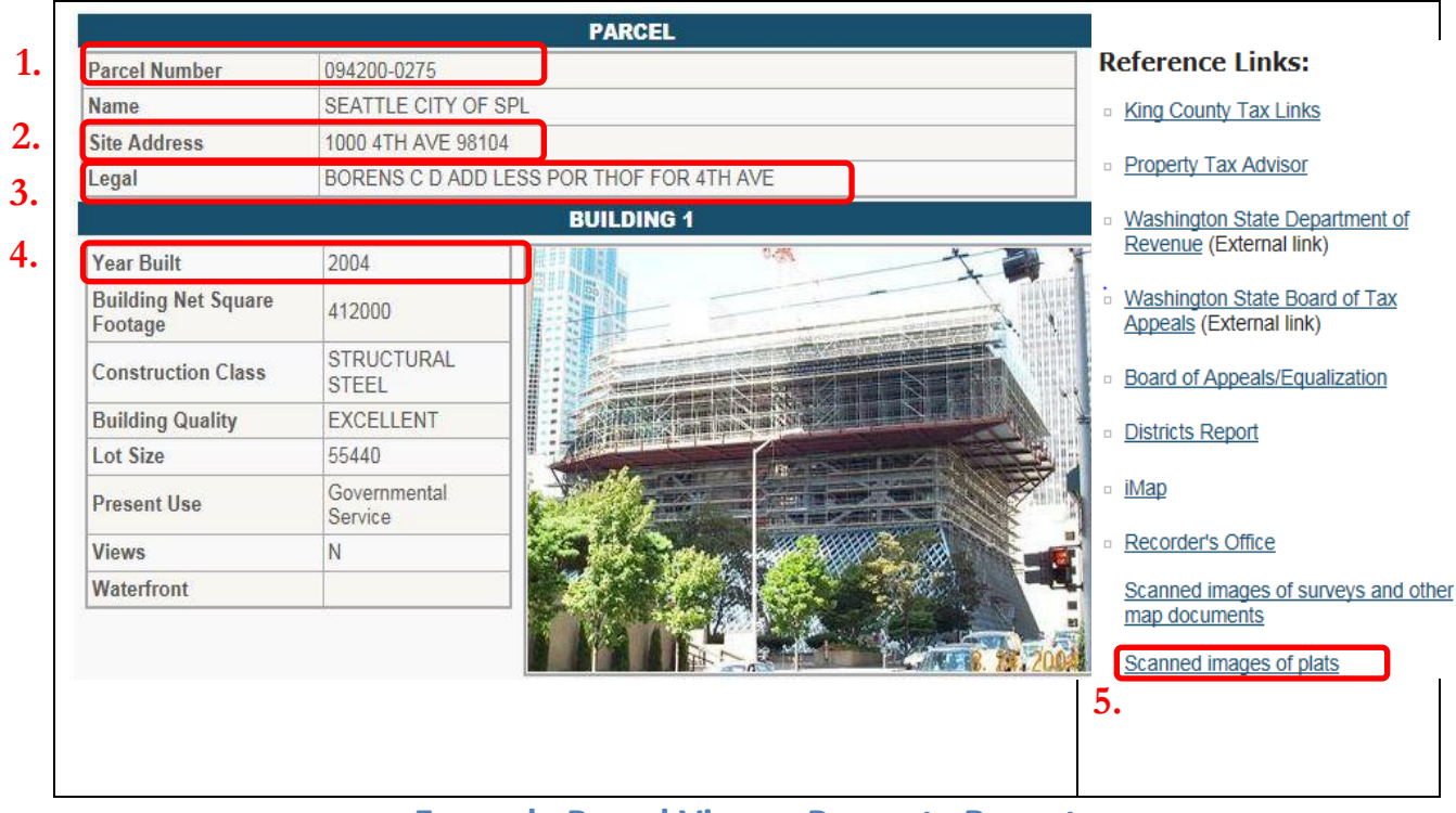
Example Parcel Viewer Property Report

The <u>King County Parcel Viewer</u> is an excellent place to collect some of the basic legal information about a piece of property. Search by address, street intersection, or parcel number to bring up a parcel, and select "Get Property Report" to view the property report with more detailed information. When the property report loads, click "Property Detail" (top bar, right side) to show the detailed report. Several key sections of the property report are particularly useful for building research.