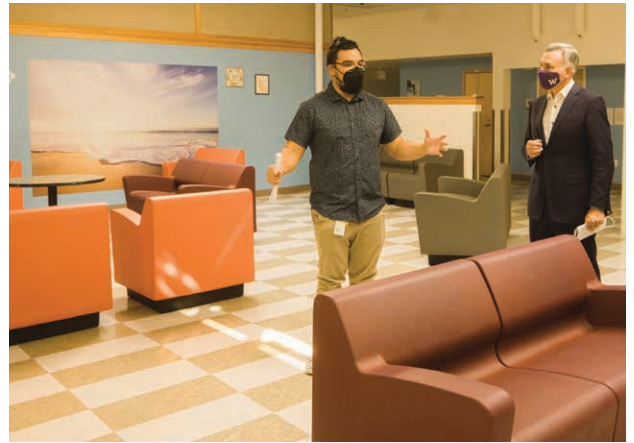
The living room space at King County's single crisis center.

King County is charting a path forward to create a regional network of crisis care centers, preserve and increase residential treatment beds, and invest in a robust behavioral health workforce. Together, these efforts will increase public well-being and safety, and give families, first responders, and crisis response teams better places to take people than jails and emergency rooms.