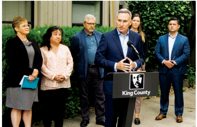
King County Executive Dow Constantine announces the final stage of purchasing Cascade Hall, a 64-bed residential treatment center in north Seattle on September 14.