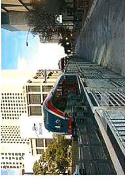
Capital Metro Rail, Austin, TX

(see handout “ERC Funders Collaborative Research”)