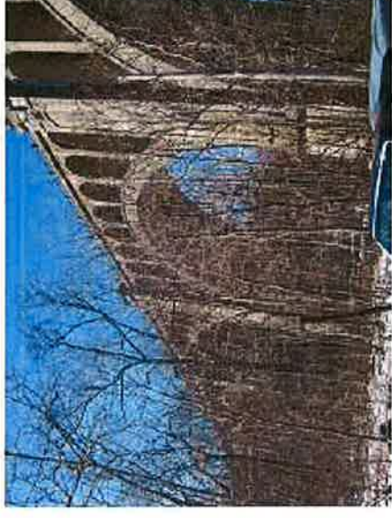
Lackawanna Cutoff, NJ