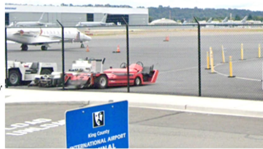
Figure 2: Example of KCIA Standard Chain Link (at Terminal Building)