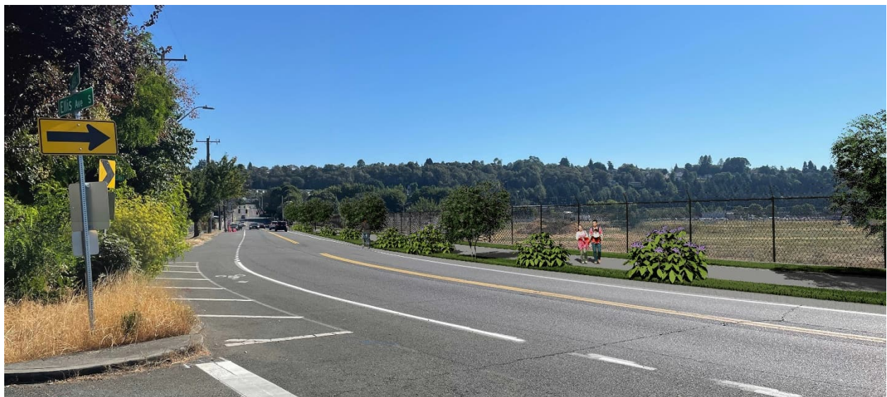
Figure 3: Rendering