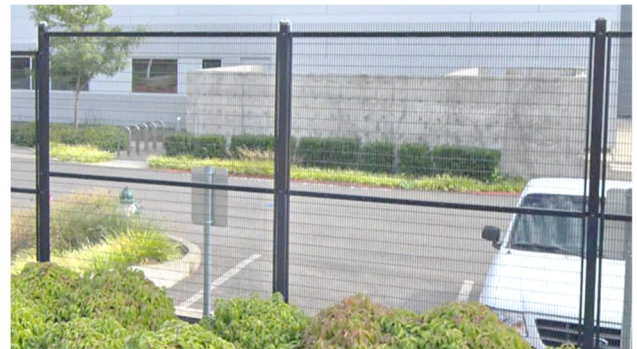
Figure 2: Example of welded wire fence, private hangar KCIA