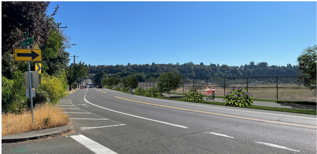
Figure 3: Rendering