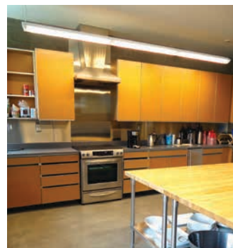
Top: Audiovisual equipment; Above: Catering kitchen