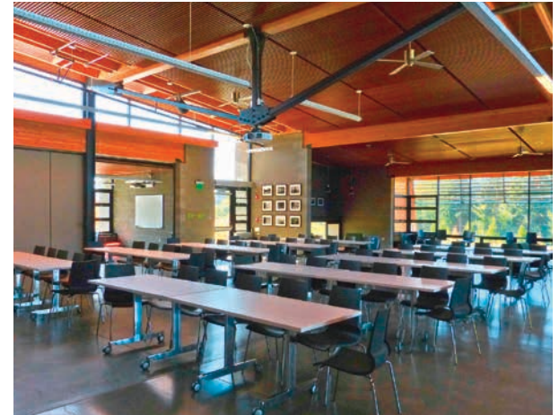
Top: North plaza; Above: Community Room