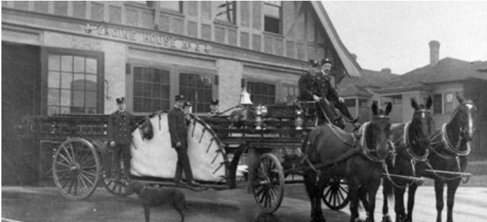
Ladder Company 3 with rescue net in 1904, the year Seattle Fire Station No. 3 opened. A motorized Engine 3 arrived in 1918. The fire station closed April 21, 1921.