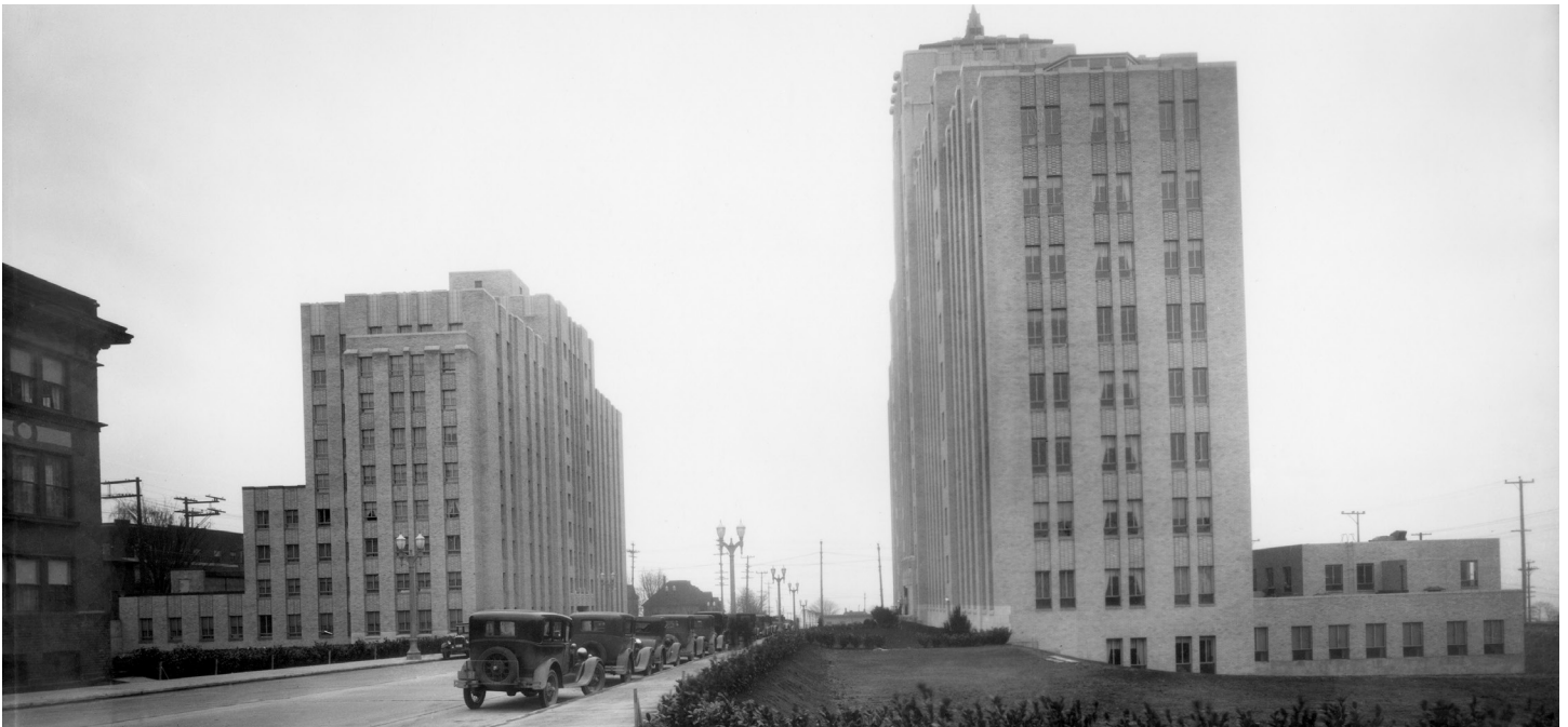
Harborview Hall is a smaller, less elaborate reflection of Harborview Hospital's architecture. They are connected by a tunnel. Photo taken in 1935; PEMCO Webster & Stevens Collection, Museum of History and Industry.