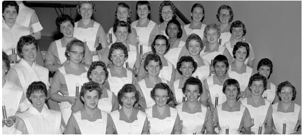
Graduation ceremony, Harborview Hall, early 1950s.