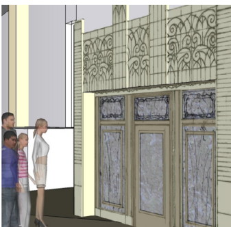
Elevator Lobby View