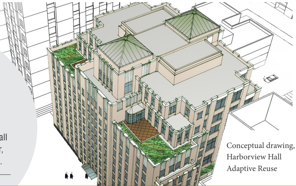
Conceptual drawing, Harborview Hall Adaptive Reuse