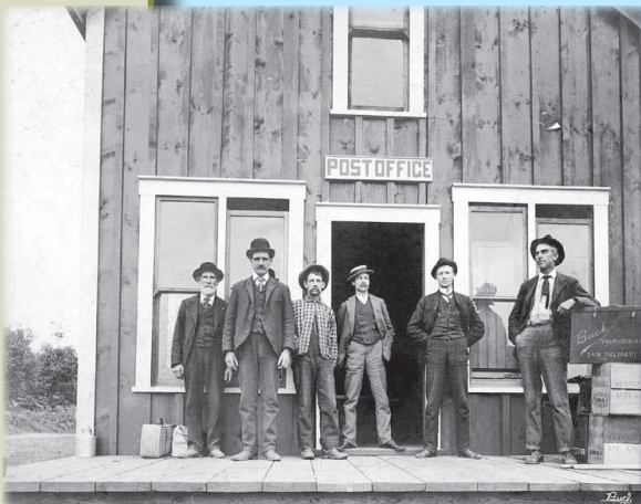
Men at post office.

Nearby: Dockton Interpretive Trail. The half-mile trail, beginning at Dockton Park, includes ten interpretive signs that tell the story of Dockton.