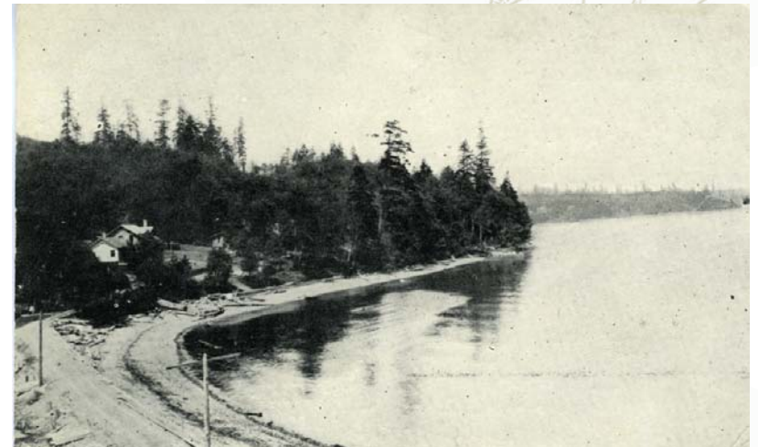
Looking north from Portage, 1914. Used by permission of Vashon-Maury Island Heritage Association, img004-003

King County road records trace the gradual realignment of Dockton Road through the 1920s and 1930s. Here, as elsewhere around the island, upgrades were made in increments. Early road segments, first established at right angles around section lines and property boundaries, were straightened by slicing through farm and forest.