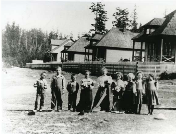
Piano Row in Dockton, ca. 1908. Used by permission of Vashon-Maury Island Heritage Association, img004-021

In 1923, the Quartermaster to Dockton Road was “declared a necessity” and scheduled for improvement under the Permanent Highway Act. This resulted in a good direct route from the main highway on Vashon to Maury Island. Soon afterward, the county declared Road No. 274 connecting Dockton to Portage a “main traveled road.”