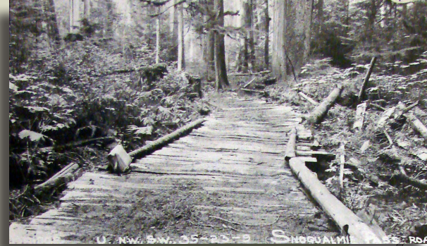
Snoqualmie Pass Wagon Road, ca. 1900. DSC02711A

The original route of this corridor, the Snoqualmie Wagon Road from Seattle to Ellensburg, was completed in 1867. Its establishment provided a direct link for trade and movement east and west of the Cascade Mountains for settlement and business.