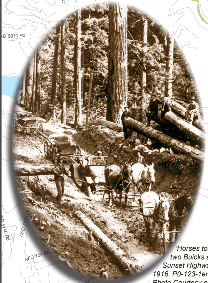
Horses towing two Buicks along Sunset Highway, 1916. P0-123-1enh