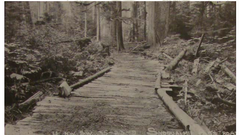
Snoqualmie Pass Wagon Road, ca. 1900.

Although maintenance of the road was challenging, cattle-droivers and miners continued to rely upon it for east-west travel. In 1883, the road was taken over by the Seattle and Walla Walla Trail and Wagon Road Co., who made investments of money and labor in its improvement. This company operated it as a toll road, and it appears as such on an 1893 Ames & Adams map of King County.