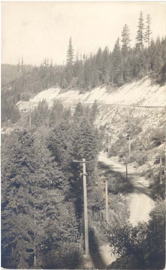
Showing old and new highways, near Denny Creek campground, ca., 1920s