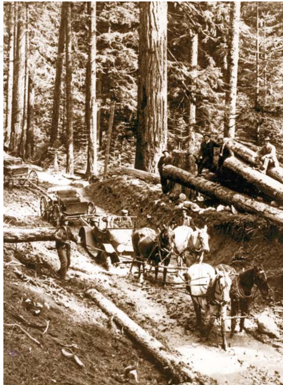
Horses towing two Buicks along Sunset Highway, 1916.

Still, no major upgrades would take place for nearly another decade, because the Chicago, Milwaukee and St. Paul Railroad, completed over Snoqualmie Pass in 1909, effectively absorbed most commercial and passenger traffic. It was not until 1909, when the Alaska-Yukon-Pacific Exposition's transcontinental auto race over Snoqualmie Pass generated widespread publicity that focus shifted to improving this road for the motorcar.