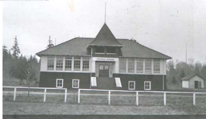
Osceola’s 3rd Schoolhouse, 1914

The northern leg of the Osceola Loop–SE 448th Street–took shape during this later period, and appears to have been constructed sometime between 1926 and 1936. Its primary segment on the east is the W.F. Stump Road No. 908, established 1910, and the H.C. Hansen Road No. 1062, established 1915. No road appears along here in a 1926 Metsker map, although it is important to note that not all established roads were actually constructed. The entire stretch is in place, however, and labeled as the Stump Road in a 1936 atlas of the county. Aerial photographs from 1937 show a fully developed agricultural landscape, with fenced pastures, cultivated fields, and orchards. The crossroads community of Osceola, and the still extant Osceola schoolhouse, are clearly visible.