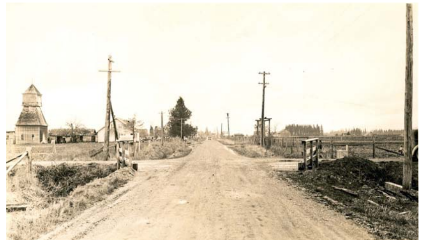
Looking east toward 228th.