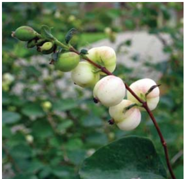
Snowberry shrub 5' to 8' tall 3 to 5' wide White berries

Planted only outside of clear sight line areas and at least 8-feet from trail.