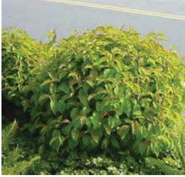
Dwarf redtwig dogwood 1' to 2' tall 2' to 3' wide Red stems

Can be planted closer to pavement and inside of clear sight line areas.