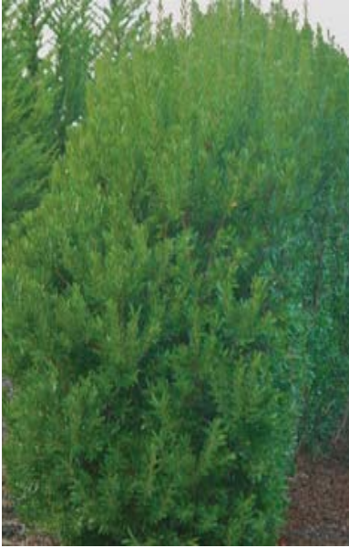
California Wax Myrtle 15' to 20' tall 8' to 15' wide Broadleaf evergreen Solid screen, native 6' wide min. area required