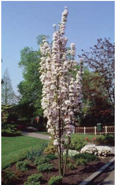
Amanogawa Cherry 15' to 20' tall 6' to 12' wide Pink flowers Space for an open row 6 wide min. area required