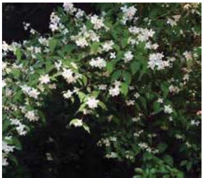
Mock orange shrub 5' to 10' tall 5' to 8' wide White flowers