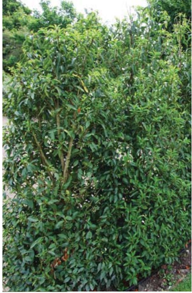
Portugese Laurel 15' to 20' tall 8' to 15' wide Broadleaf evergreen Solid screen, trim to hedge 6' wide min. area required