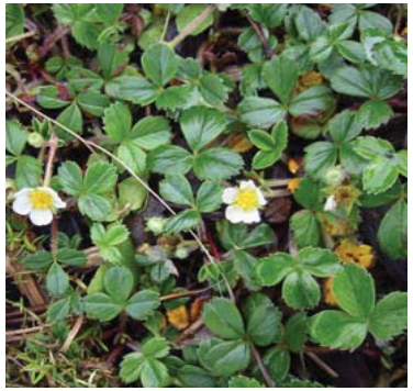
Kinnikinnick 1" to 3" tall 1' to 4' wide Evergreen