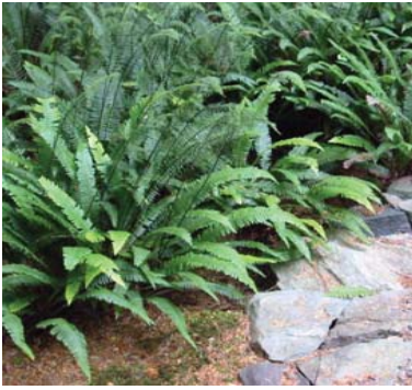
Deer or sword fern 1' to 2' tall 1' to 3' wide Evergreen