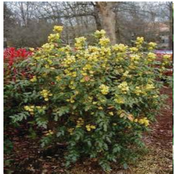
Tall Oregon grape 4' to 8' tall 3' to 5' wide Evergreen