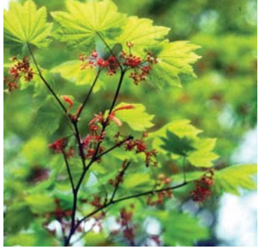
Vine Maple 10' to 20' tall 8' to 15' wide Orange/red fall color