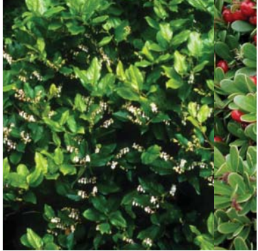
Salal 1' to 3' tall 1' to 4' wide Evergreen