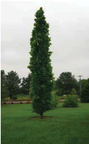
Slender Sweetgum 30' to 40' tall 4' to 6' wide Yellow fall color Space for an open row 6' wide min. area required