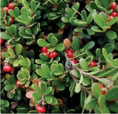
Kinnikinnick 3" to 6" tall 2' to 4' wide Evergreen