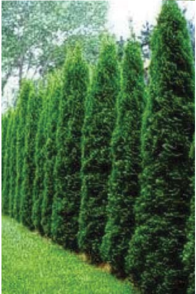
Pyramidalis Arborvitae 12' to 25' tall 3 to 4' wide Evergreen conifer Space close for solid screen 3' wide min. area required