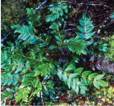
Low Oregon grape 1' to 2' tall 1' to 2' wide Evergreen