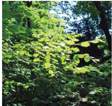
Beaked Hazelnut 5' to 15' tall 5' to 12' wide Yellow fall color