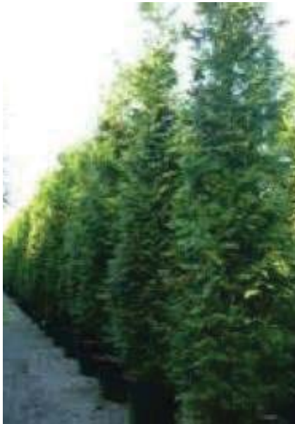
Excelsa Cedar 30' to 40' tall 10 to 15' wide Evergreen conifer Solid screen, trim to hedge 6' wide min. area required