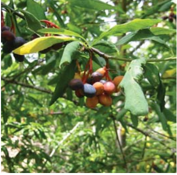
Indian plum 10' to 15' tall 8' to 10' wide Orange/ dark blue berries

Note: Soil conditions and sun exposure should be considered for plant selectionn for particular locations.