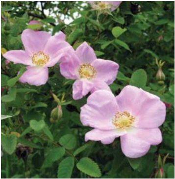
Nootka shrub rose 5' to 8' tall 3 to 5' wide Pink flowers, red hips