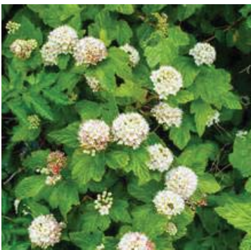
Pacific Ninebark shrub 8' to 15' tall 8' to 15' wide White flowers