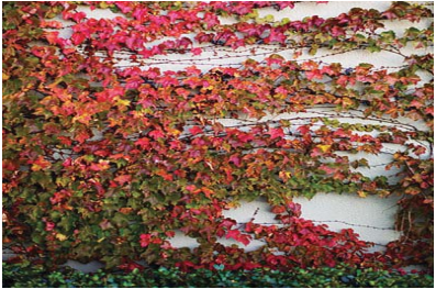
Boston Ivy 10' to 20' tall 8' to 15' wide Deciduous Red fall color 2' wide min. area required

Note: Both available ground space for root growth and vertical clearance need to be considered for plant selection.