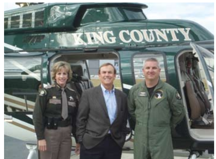
King County Sheriff Sue Rabr, Pete and Deputy Keith Potter during the presentation of the state-of-the-art Guardian One helicopter.

King Street Center (206) 296-6590 201 South Jackson Street Seattle, WA 98104