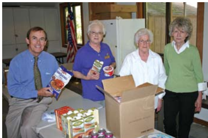
Pete recognizes the members of the Federal Way Senior Center, as they organize food pantry donations.

Burien Courthouse 601 SW 149th Street Burien, WA 98166