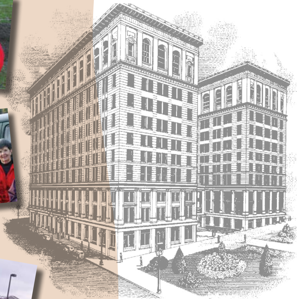
Vintage engraving of the King County Courthouse, Seattle